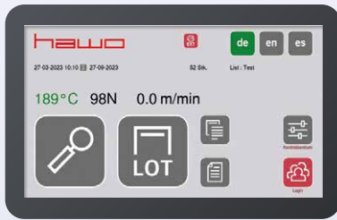
Self configurable main screen