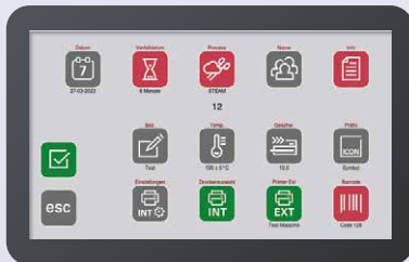
User friendly and intuitive applications (AppCtrl®)