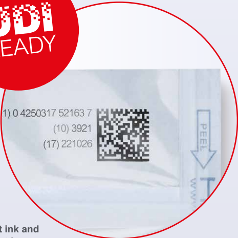
Wipe resistant ink and precise print image