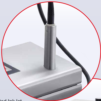
Integrated InkJet print probe